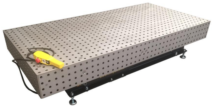
Symbol image: SWT E 35-100/ 16 SL-200 Ø16 lower position