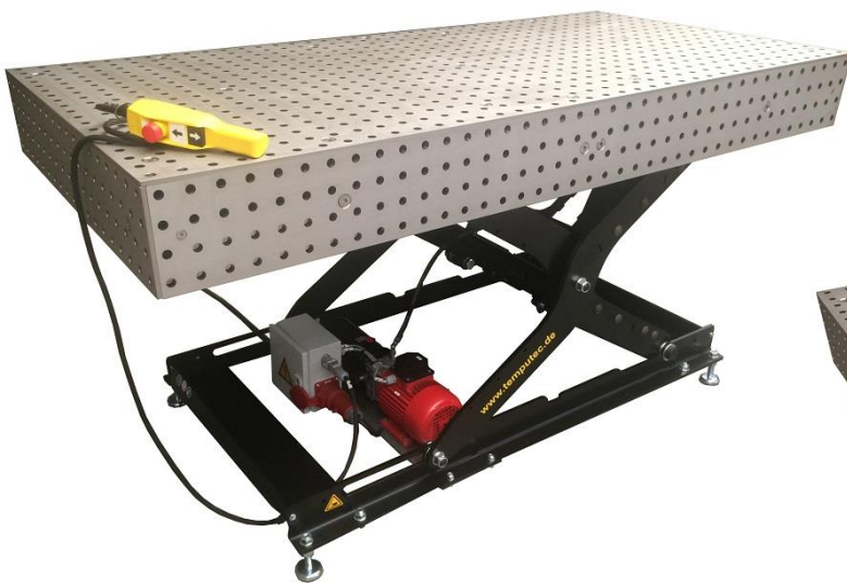
Symbol image: SWT E 35-100/ 16 SL-200 Ø16