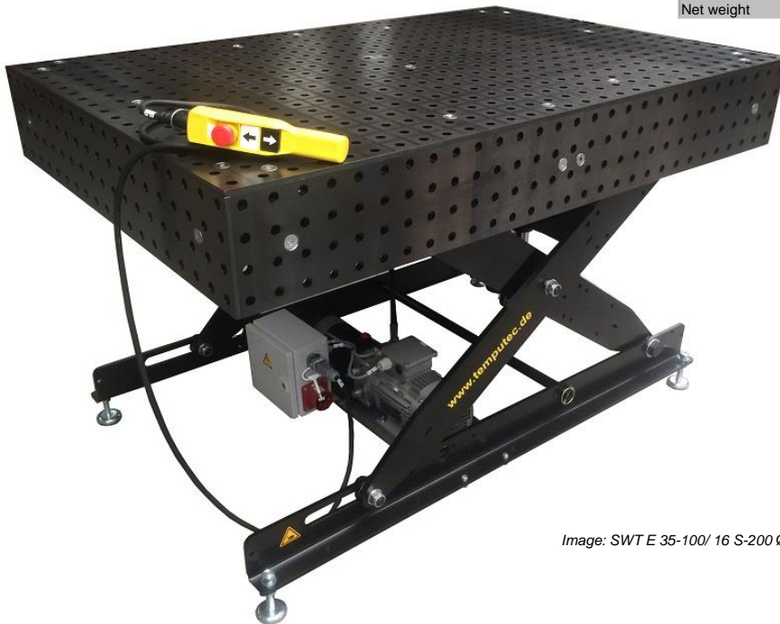
Image: SWT E 35-100/ 16 S-200 Ø16