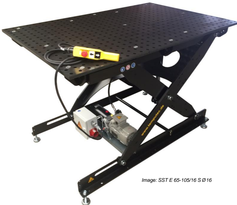
Image: SST E 65-105/16 S Ø16