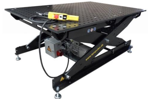
Image: SST E 65-105/16 S Ø16 lower position