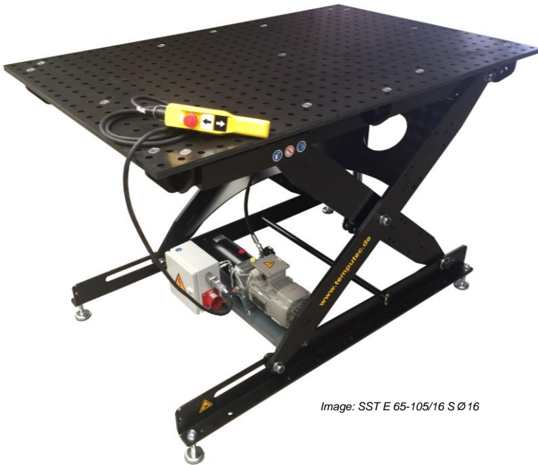
Image: SST E 65-105/16 S Ø16