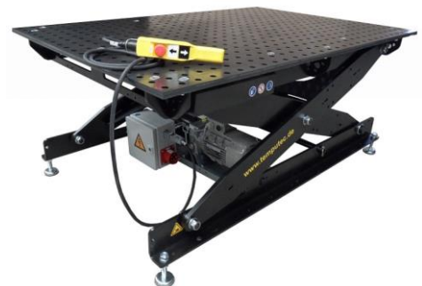
Symbol image: SST E 65-105/16 S Ø 16mm (lower position)