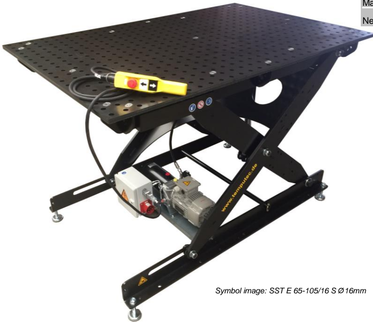
Symbol image: SST E 65-105/16 S Ø 16mm