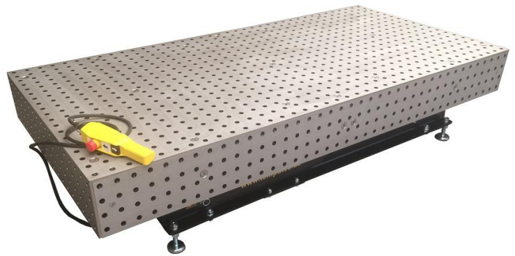
Image: SWT E 35-100/ 16 SL-200 Ø16 lower position