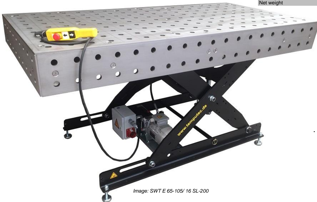
Image: SWT E 65-105/ 16 SL-200