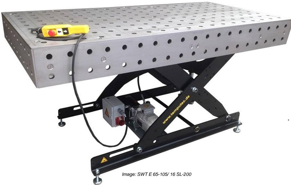
Image: SWT E 65-105/ 16 SL-200