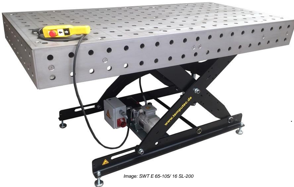
Image: SWT E 65-105/ 16 SL-200