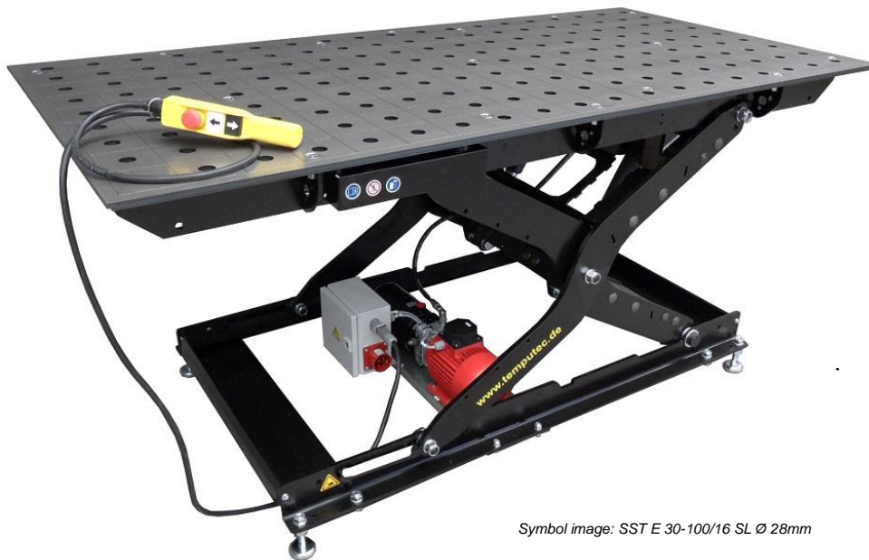
Symbol image: SST E 30-100/16 SL Ø 28mm